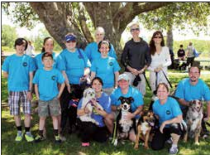
Portsmouth Veterinary Clinic team

The event featured a 1-mile walk, pet contests, informational booths with vendors marketing everything from preventatives and microchips to wholesome foods, pet insurance, obedience training and animal massage services in addition to real estate and banking services.