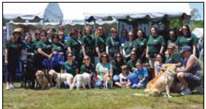
People’s Pooch Patrol