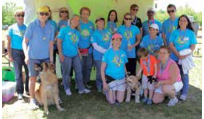
VIP (Volunteers Impact Pets) Team