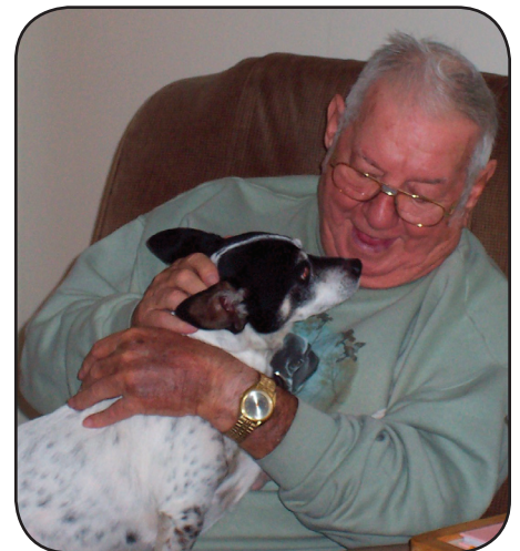
Rascal fills a need and a lap.

Floyd and Peaches were destined to be together. Both were senior cats who had been given up by elderly owners. Both were at the shelter at the same time though they didn't actually